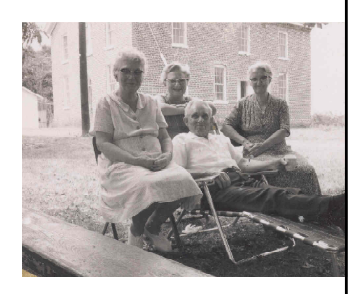
Smith Family Gathering at the Courthouse Date Unknown